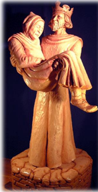
St. Edward the Confessor